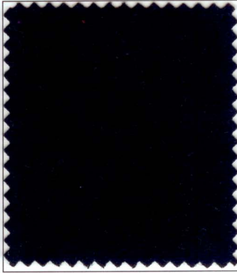
ENCORE™ 15 oz. / 62" WIDE BLACK