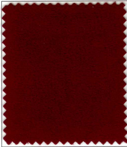
ENCORE™ 22 oz. / 64" WIDE CABERNET

22 oz. 64" / 15 oz. 62" WIDE · 100% POLYESTER 22 oz. INHERENTLY FLAME RETARDANT / 15 oz. DURABLY FLAME RETARDANT